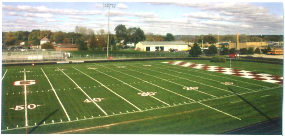
Grant HS football field, taken before the last game of the season