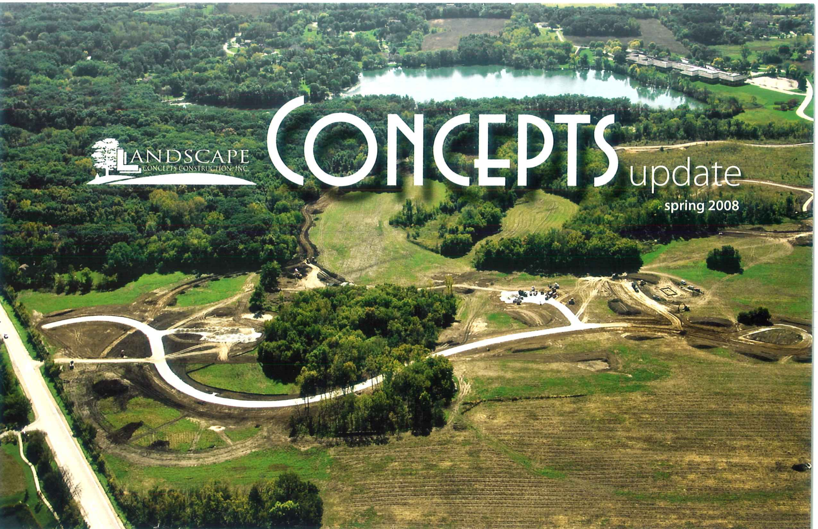
LCCon blazes a trail at Heron Creek in Long Grove, IL

L andscape Concepts Construction is a long name for a company long known for outstanding service, exceptional quality, attention to detail and on-time performance.